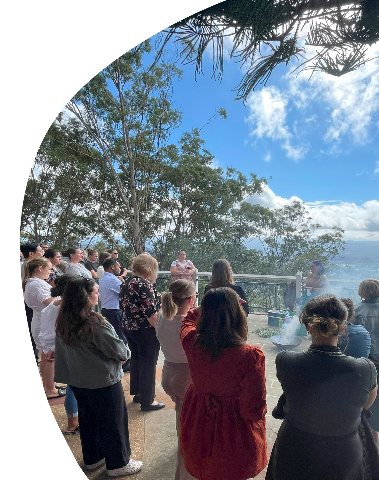
Image: PHN staff participate in a Smoking Ceremony